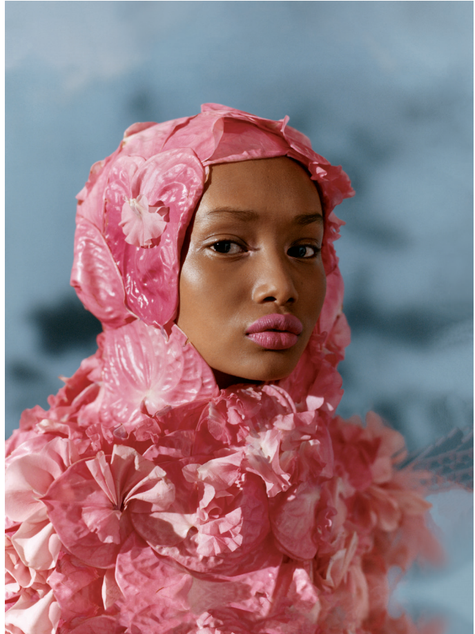
Untitled (Hijab Couture I), New York, 2019

Photographer and filmmaker Tyler Mitchell creates lightsome images of Black youth culture. Drawing on his childhood in suburban Atlanta, he has created portraits of Black men and women in lush, idyllic green spaces and colour-filled studios that are suggestive, for him, of a Black utopia. In these images, shot with what he characterises as ‘an honest gaze’, his subjects are free from the insult of racism and discrimination and often engage in mundane activities. “To convey Black beauty is an act of justice,” he says. Mitchell developed his approach to portraiture at New York University’s Tisch School of the Arts where he received a BFA in film and television in 2017. There, he became interested in documenting the style, identity, and beauty of young Black men as a way to synthesise “what I see to be a full range of expression possible for a Black man in the future,” he explains. In 2018, Mitchell became the first Black photographer to shoot the cover of American Vogue and was listed on Forbes’s 2019 30 under 30.