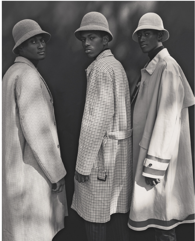
Three Men, 2018